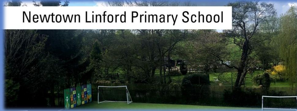
Newtown Linford Primary School

We send fortnightly bulletins and half termly newsletters via Arbor. We also update our webpage regularly. You can find lots of information for parents at: https://www.newtown.bepschools.org